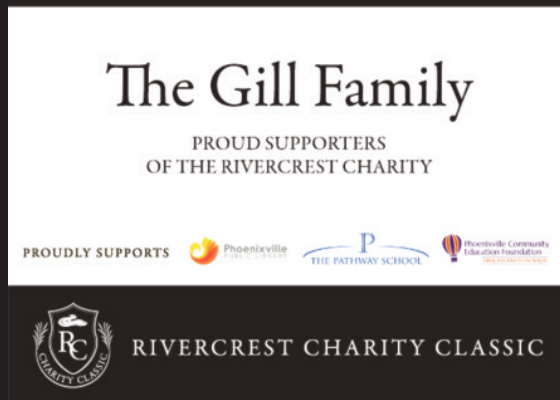
Member Tee Sign Example

RiverCrest Charity Tee Signs are a great way to not only contribute, but show your support and appreciation of this great cause. We are looking for both companies and members to donate $250 to have their tee sign at the Charity Classic tee boxes.